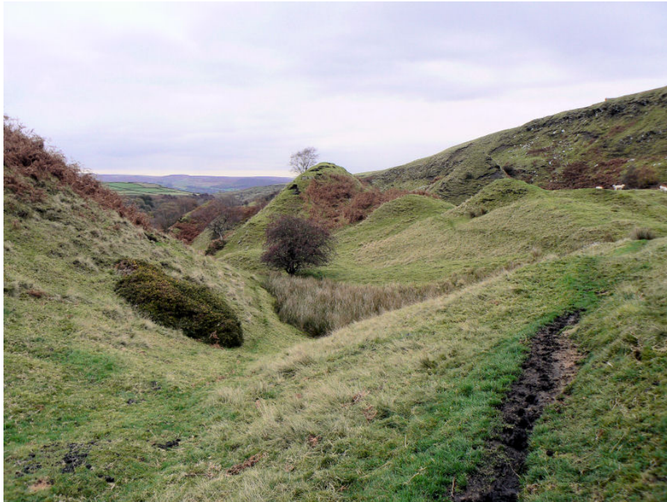
Bretton Clough

Including the East Midlands Championships